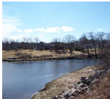
Nearby Cape Neddick River

Coastal Property Development, Inc. is a dba of First Step Land. For more information about this property please call (207) 363-0681 or email: info@coastalpropertymaine.com . All inquires are held in strict confidence.